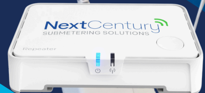
RE4 Repeater 4 5/8" x 3" x 1"