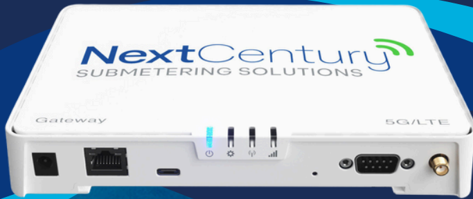
GW4 Gateway 7 5/8" x 5" x 1 18"